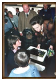
Freshly caught Canna Lobsters - a local delicacy

attention to detail. The Marquee was speedily erected the previous day by North of Scotland Marquees of Nairn and provided welcome shelter from indifferent weather.