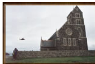
The Royal Helicopter prepares to land on Sanday

After a special private visit to Canna House to meet Margaret Fay Shaw, the Princess Royal's helicopter made the short hop across Canna Harbour and after being greeted by local dignitaries the Opening Ceremony took place. The Princess then had a chance to tour the building and meet the island children.