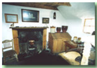
Inside the Sandaig Museum

Derek Wolstencroft has completed thatching the cottage and byre. The introduction of afternoon teas at the neighbouring Glassary restaurant will be welcomed by thirsty museum goers.